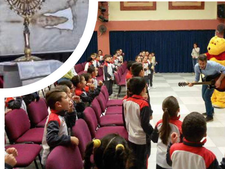
In the Schools